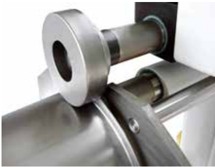
Flanging wheels FL: Flanging without swiveling the part.