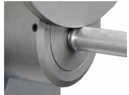
Hose seam for hydraulic pipes