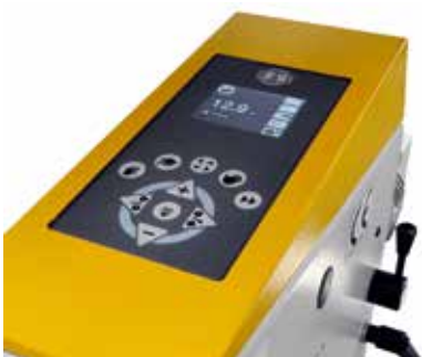
Glass panel touch control