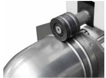
Double seaming wheels