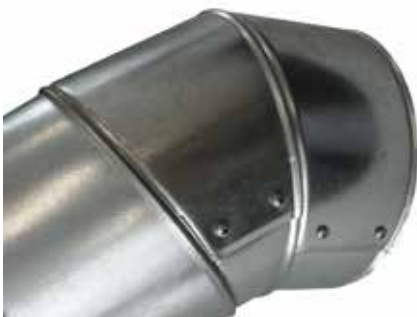
Swaging wheels for insulation work