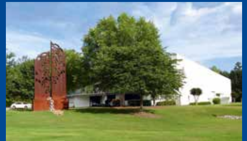
RAS Systems LLC in Georgia, USA

All sheet thickness refer to 400 N/mm 2 tensile strength. Subject to changes. Pictures may show options.