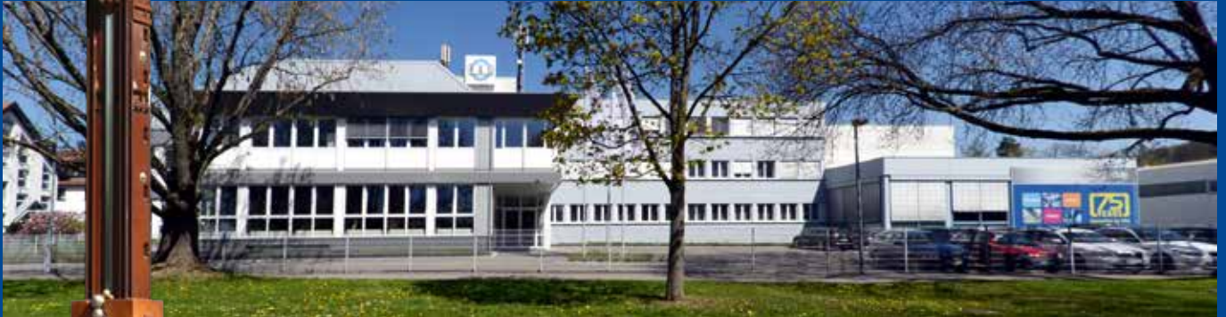
Headquarters in Sindelfingen. In the foreground „Steel object“.