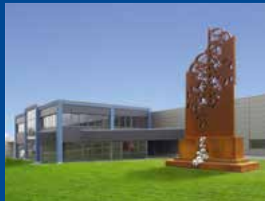
Efringen - factory and artwork