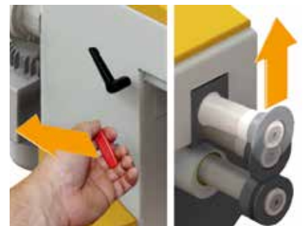
UnLock function opens the wheels immediately in an emergency.