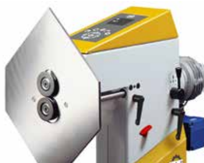
Stop plate for insulation pipes